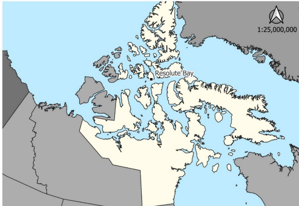
Figure 2.1: Genset Replacement Community Location